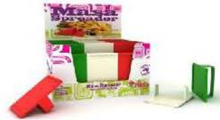
Tamale Masa Spreader