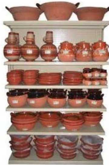
4 ft section clay products