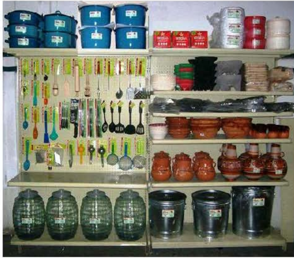
Suggested 8 ft seccion