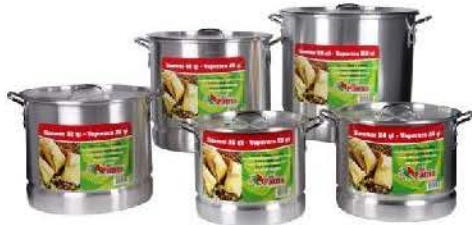
Aluminum Nested Steamers