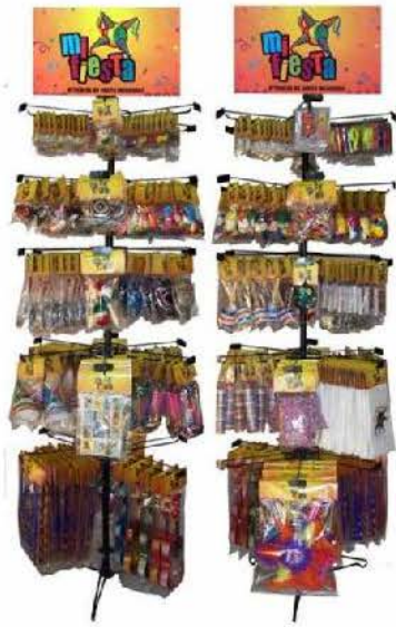
Party supply spinning rack