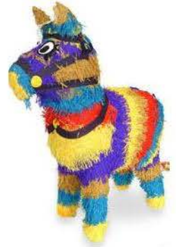
33 in tall Pinatas