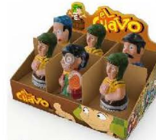
Piggy Banks El Chavo