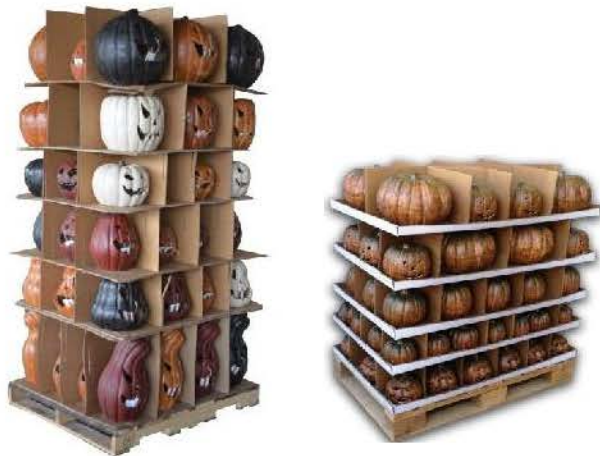
Ready to Display Pallets