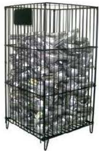
Lemon Squeezers basket